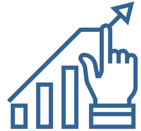
Demand Forecasting US/Global Forecasting and Commercial Analytics teams