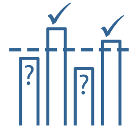
Trade Scorecarding Trade executives and account managers