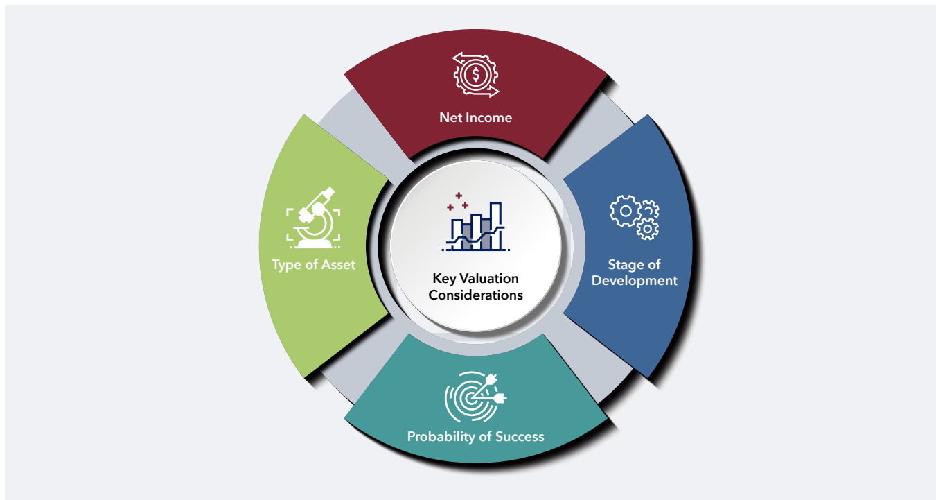
Figure 2: Key Valuation Considerations

An asset's overall value can differ greatly based on whether it is a targeted single molecule or a platform. Because a platform asset generally has utility in more than one indication/patient type, its value reflects the additive value of multiple potential drug approvals. As a result, platform assets will have a much higher 'upside' value compared to a single molecule asset. An example of a hypothetical platform asset is an antibody-drug conjugate product that can target different diseases by slight alteration of the product, either on the antibody end or the drug end.